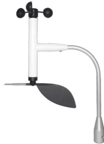
WSD 010-1 (standard range WSD sensor) WSD 011-1 (extended range WSD sensor)