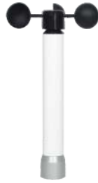
WS 010-1 (standard range WS sensor) WS 011-1 (extended range WS sensor)