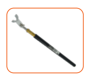
SPRING SUPPORT / PUSHER WAND (18"-72") ITEM#11935