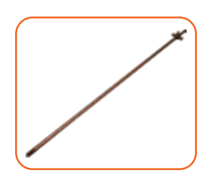
GROUNDING ROD ITEM #14196