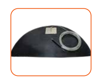
GROUND PAD (FOR USE WITH 790 ONLY) ITEMS: 12239 (3' x 1.5'), 13419 (6' x 3')