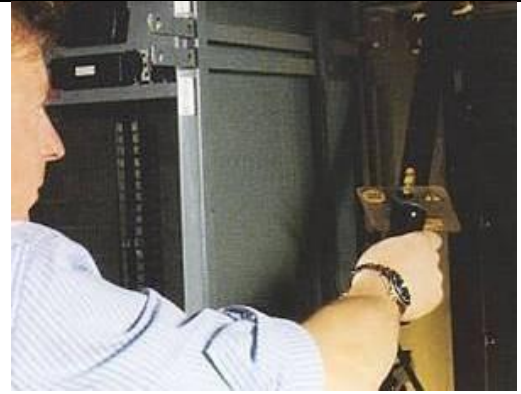
HVI - Switchgear Testing