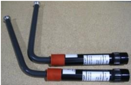
Bent End Adaptors