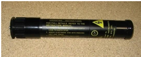
HVI Proving Unit

Range: 0.2 to 15kV 50/60HZ and DC Circuit Current: 0.4mA nominal at 15kV 0.293mA nominal at 11kV Dielectric Test: 20kV for 1 minute Length: 485mm Diameter: 32mm Weight: 0.6kg