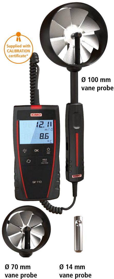
Ø 100 mm vane probe